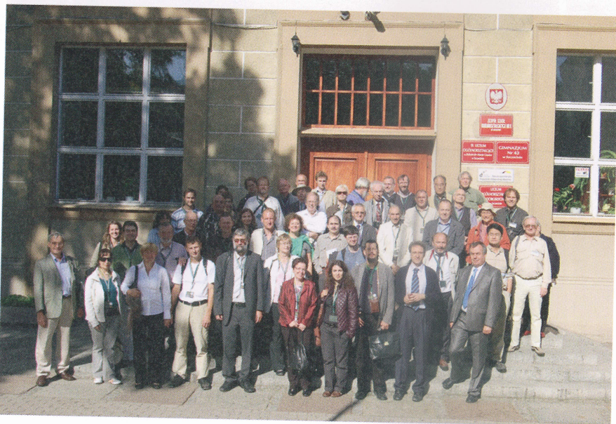
Illustration 5. Participants of the Grassmann Conference in front of the former Marienstifts-gymnasium in Szczecin