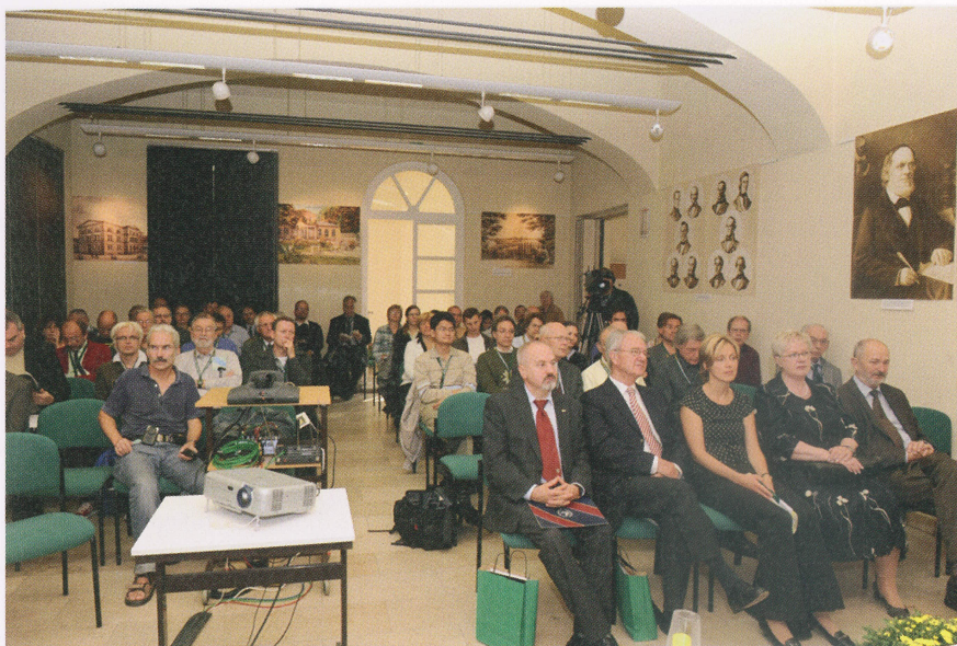
Illustration 2. Opening session of the Grassmann Bicentennial Conference in Potsdam